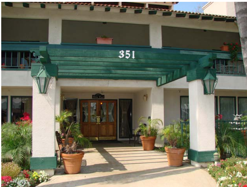
03-2007-05-02_006 P_E: Before - Main entrance to Palm East.