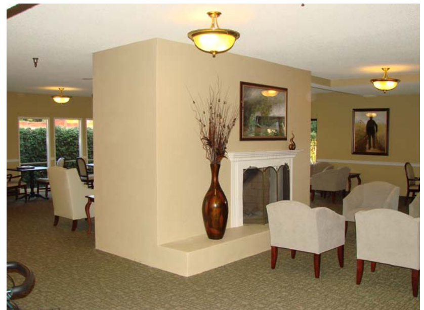
52-2009-07-31_DSC09256: After - 1st floor living room.