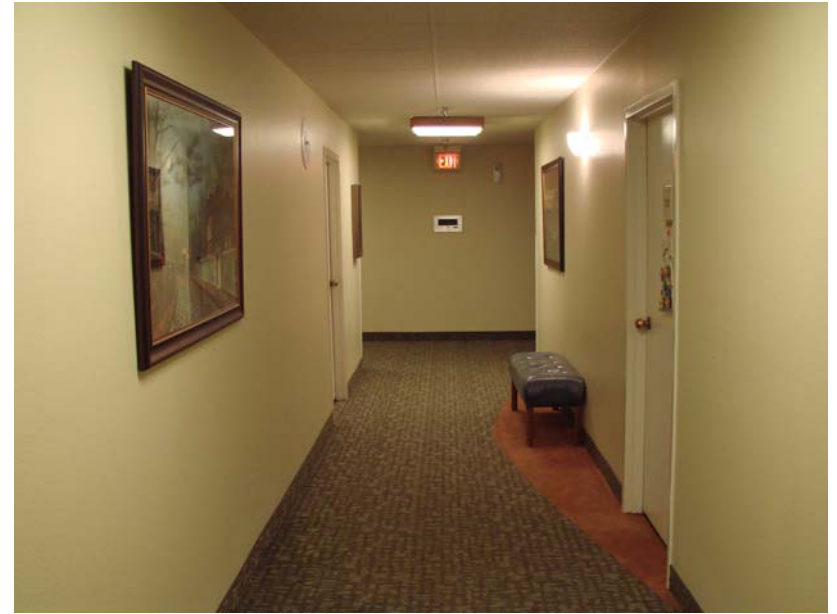
34-2009-07-31_DSC09323: After - Main entrance & corridors