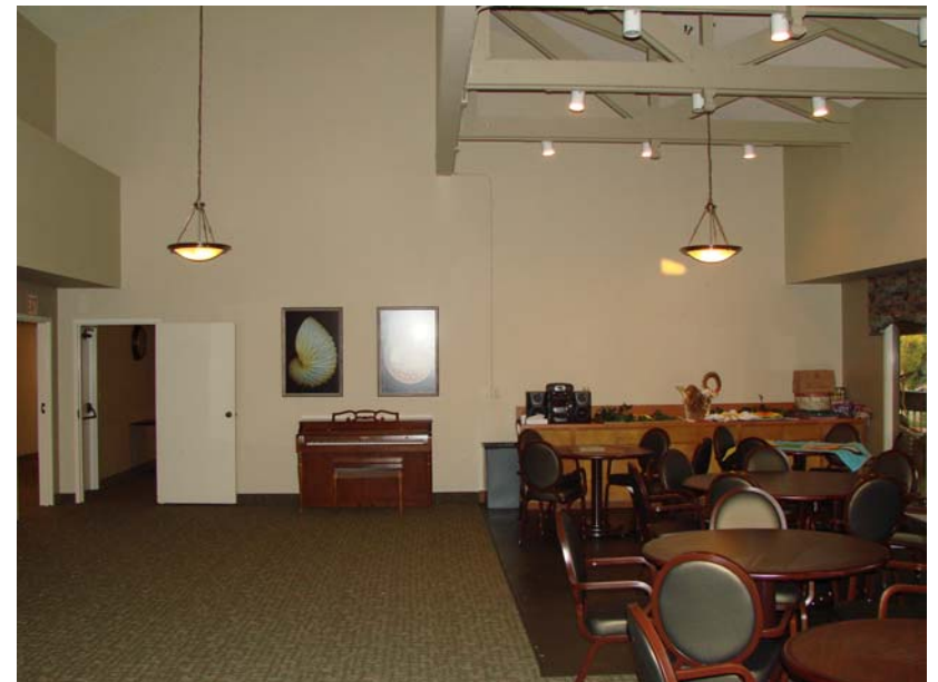
72-2009-07-31_DSC09350: After - 2nd floor game-recreation room.