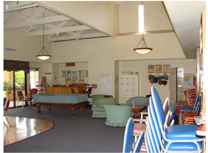
70-2007-05-02_110 P_E: Before - 2nd floor game-recreation room.