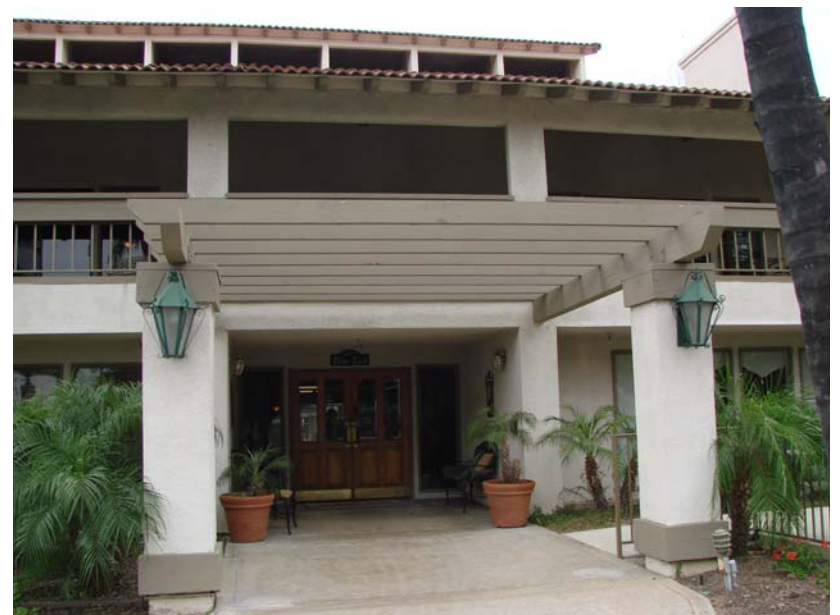
04-2009-04-23_DSC09261: After - repaired and re-painted wood.