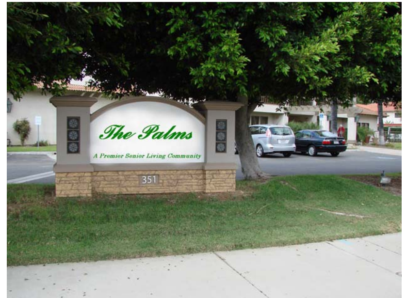
02-2009-04-23_DSC09363: After - New monument sign (name edited for privacy)