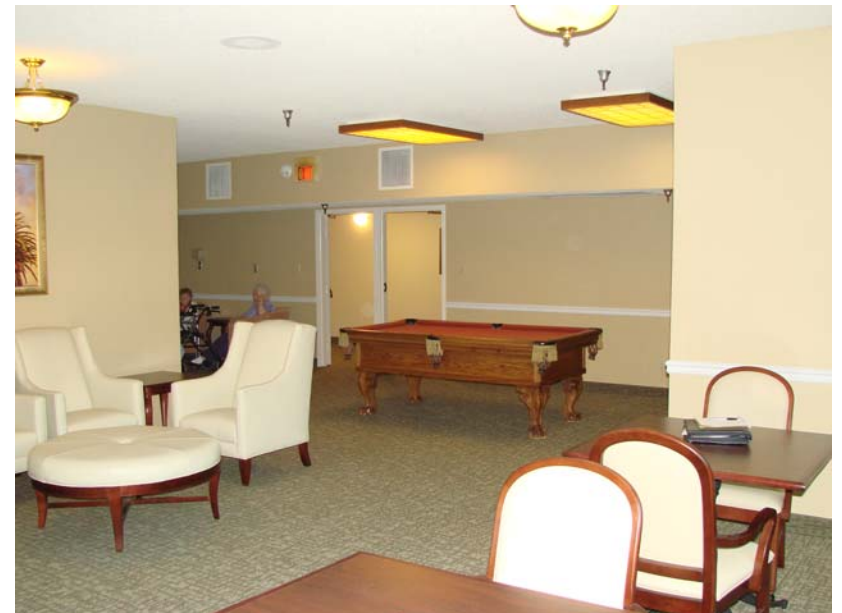
60-2009-07-31_DSC09227: After - 1st floor living room.