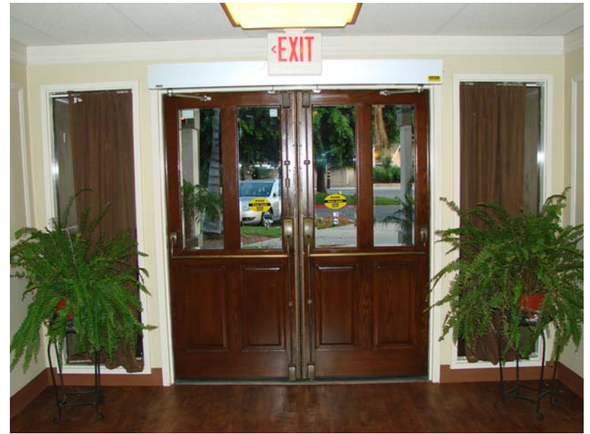
18-2009-07-31_DSC09398: After - Re-finished front entry doors.