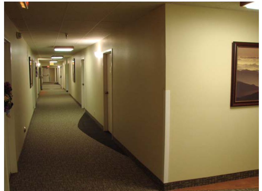
32-2009-07-31_DSC09325: After - Main entrance & corridors