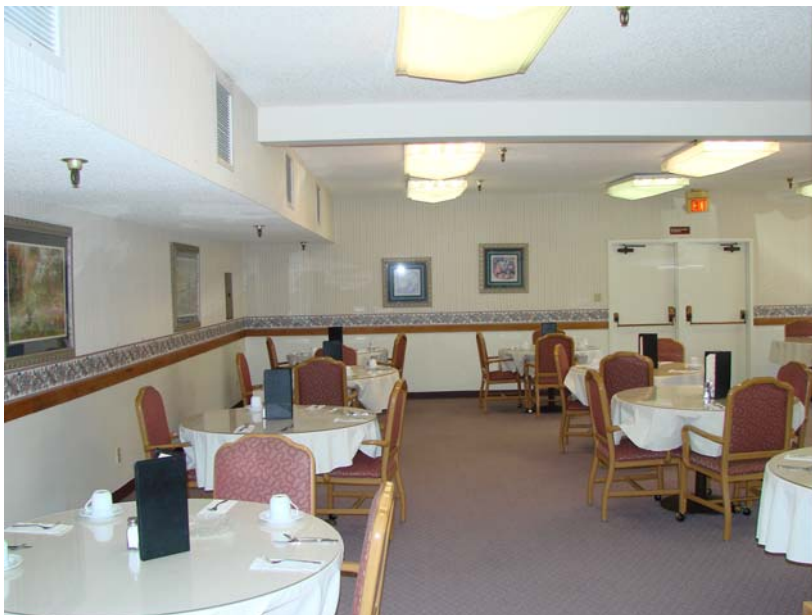
39-2007-05-02_067 P_E: Before - Main dining room.