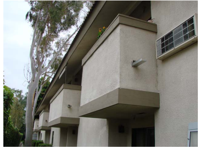
14-2009-04-23_DSC09246: After - repaired and re-painted wood.