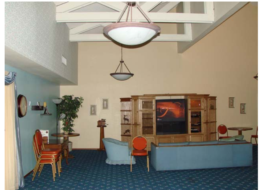
64-2007-05-02_105 P_E: Before - 2nd floor TV-Activity room.