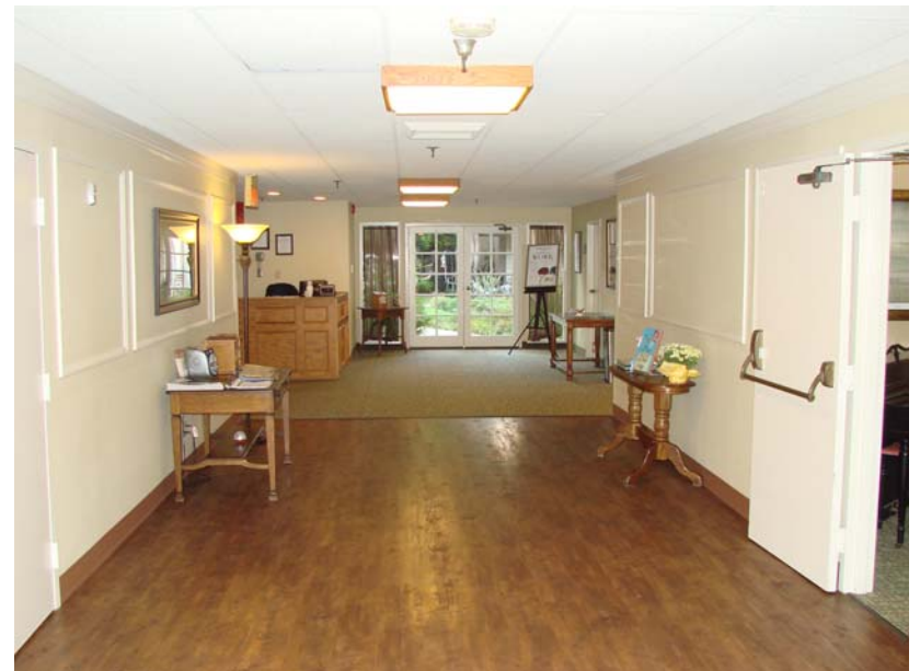
28-2009-07-31_DSC09271: After - Main entrance & corridors