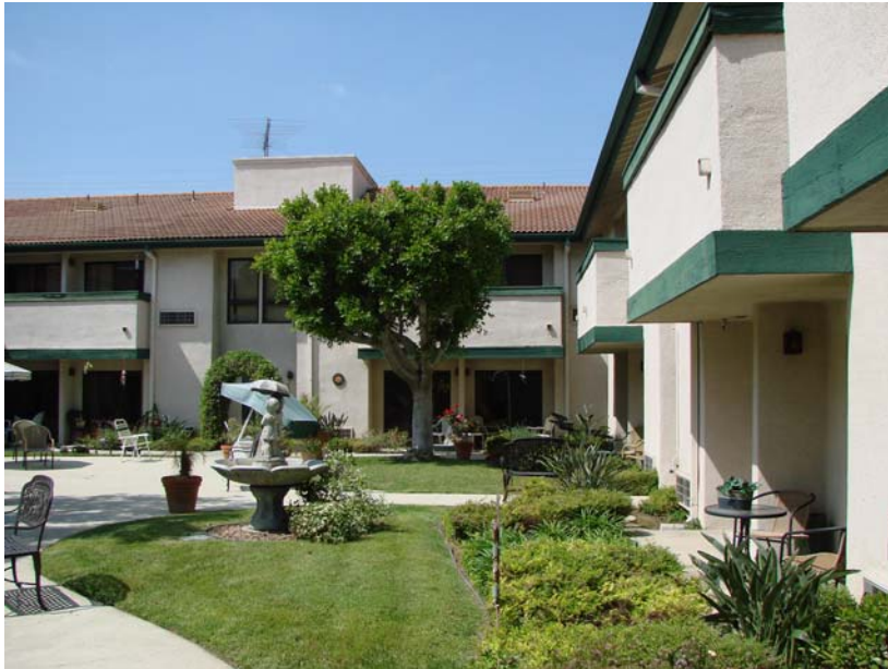
13-2007-05-02_158 P_E: Before - Interior courtyard.