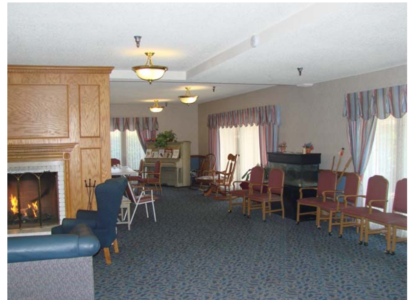
44-2007-05-02_062 P_E: Before - Living room.