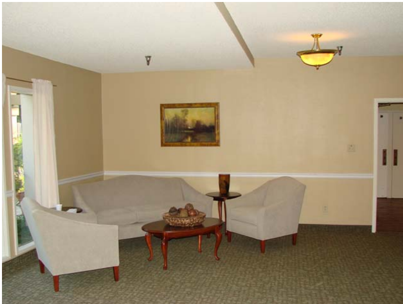
55-2009-07-31_DSC09242: After - 1st floor living room.