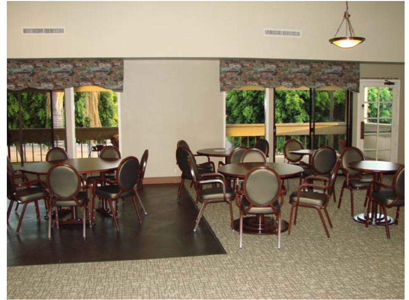
74-2009-07-31_DSC09349: After - 2nd floor game-recreation room.