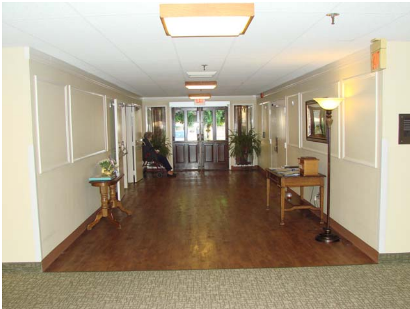
27-2009-07-31_DSC09270: After - Main entrance & corridors