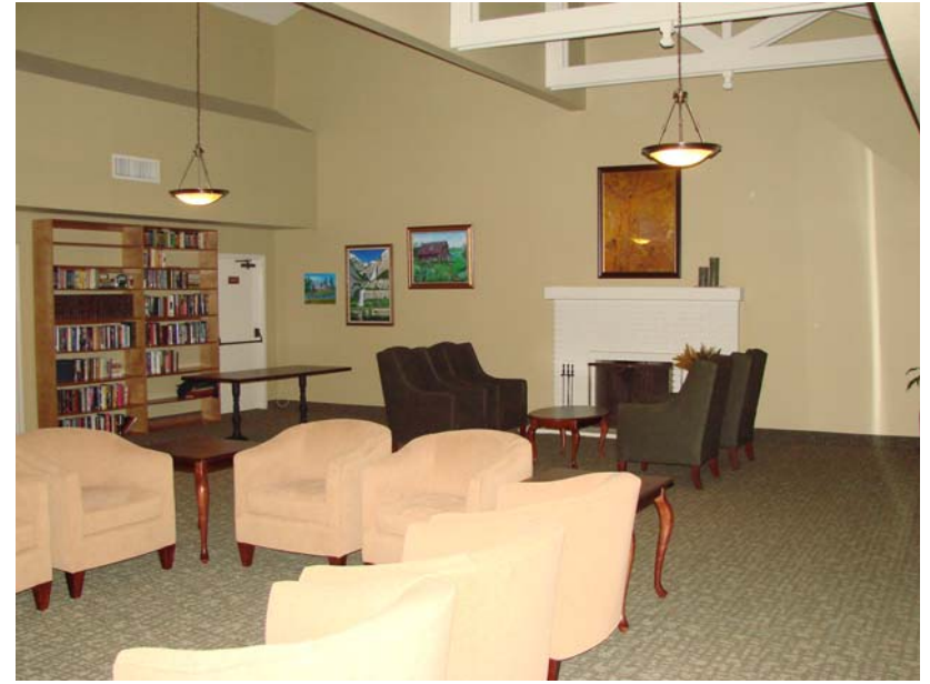
66-2009-07-31_DSC09509: After - 2nd floor Library & Movie Room