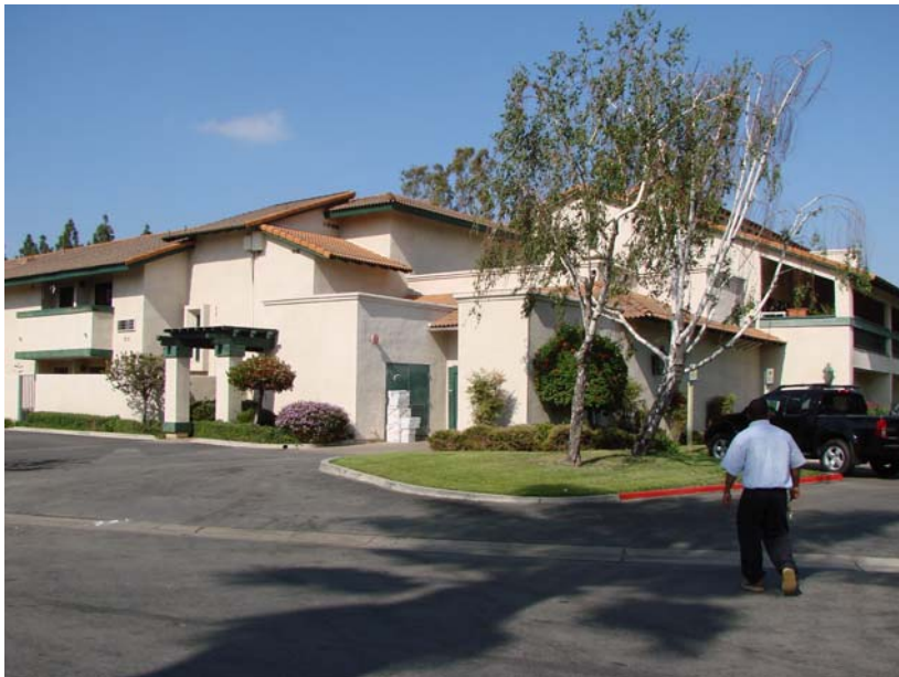
07-2007-05-02_014 P_E: Before - Palm East service entrance - water heater room & kitchen delivery area.