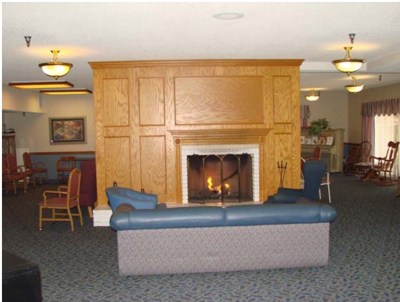
43-2007-05-02_061 P_E: Before - Living room.