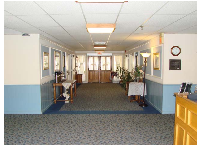
20-2007-05-02_053 P_E: Before - Front entry.