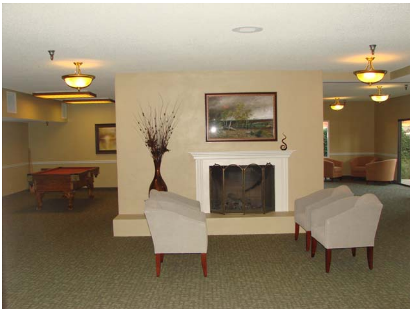
51-2009-07-31_DSC09250: After - 1st floor living room.