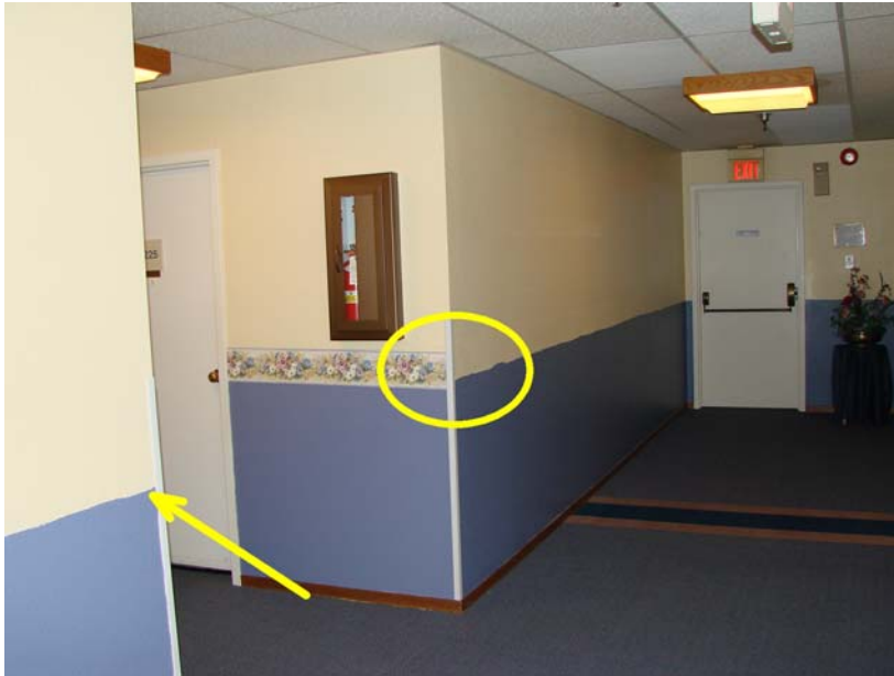
25-2007-05-02_124 P_E: Before - 2nd floor east hall @ north end. Note missing wallpaper border - staff i sin the process of installing border after painting