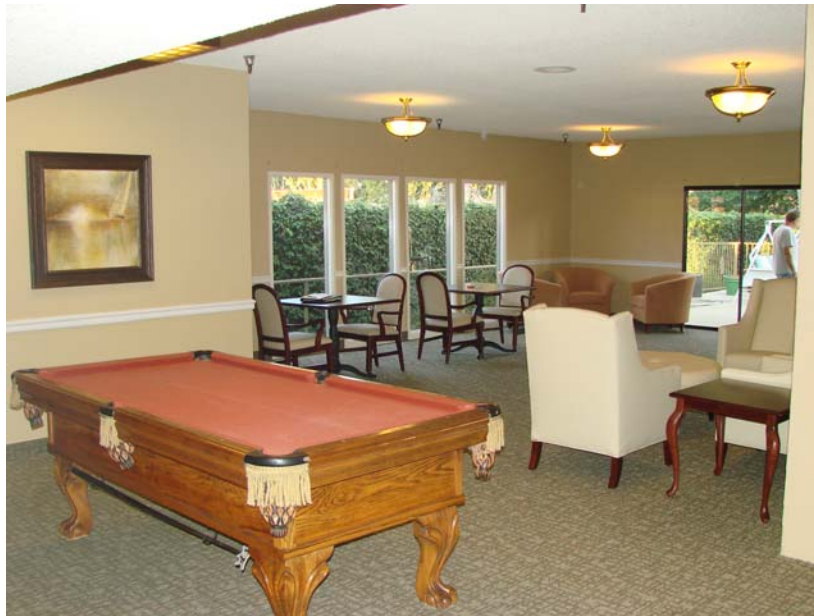
61-2009-07-31_DSC09267: After - 1st floor living room.