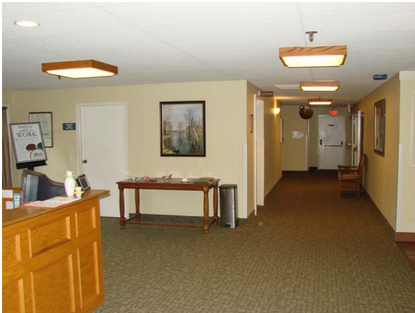
31-2009-07-31_DSC09278: After - Main entrance & corridors