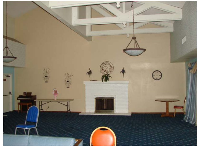
62-2007-05-02_102 P_E: Before - 2nd floor TV-Activity room.