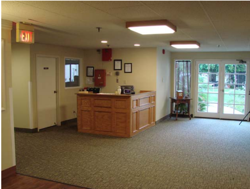
29-2009-07-31_DSC09274: After - Main entrance & corridors