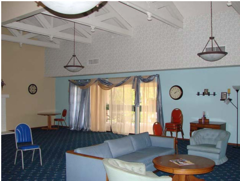
63-2007-05-02_103 P_E: Before - 2nd floor TV-Activity room.