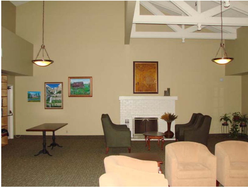
65-2009-07-31_DSC09490: After - 2nd floor Library & Movie Room