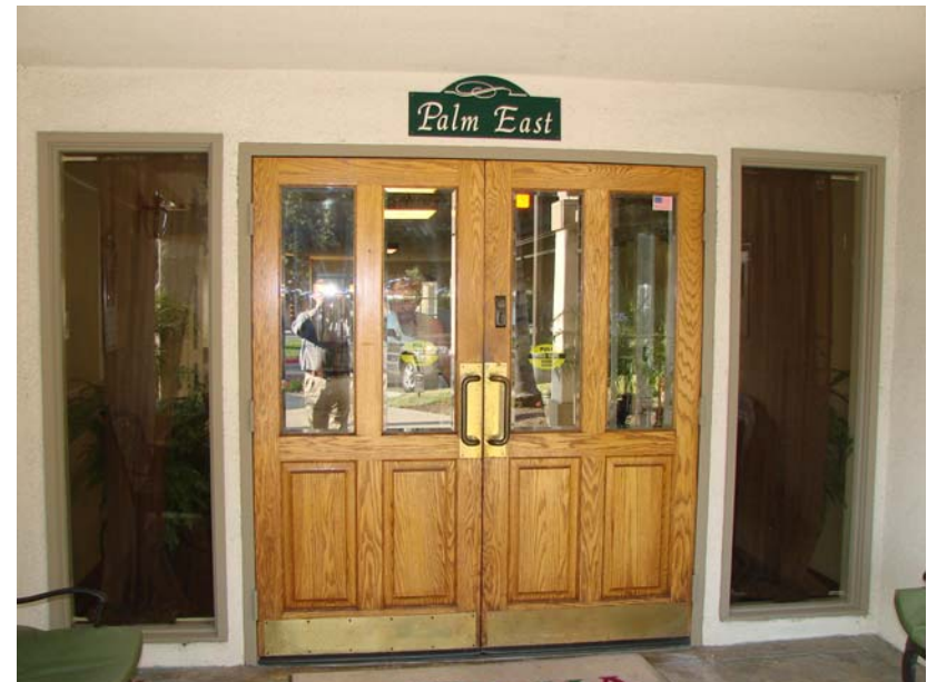
16-2009-04-23_DSC09436: Before - Front entrance doors need to be re-finished.