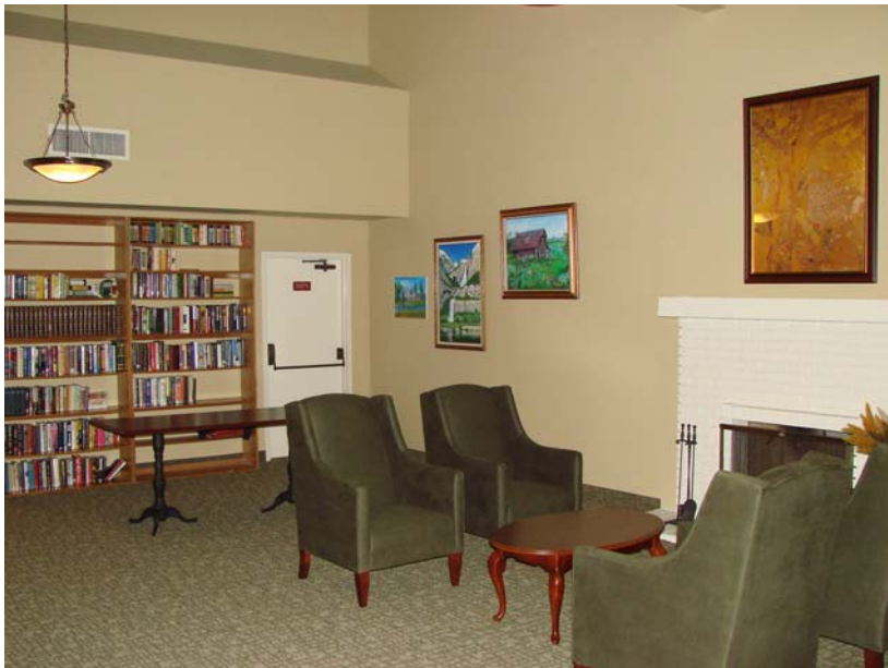
67-2009-07-31_DSC09494: After - 2nd floor Library & Movie Room