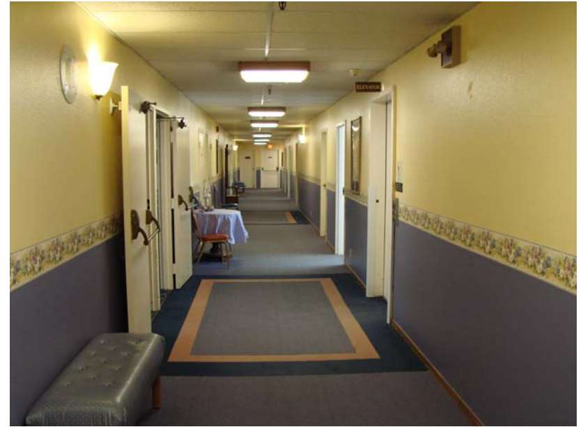
22-2007-05-02_093 P_E: Before - Palm East - typical 2nd floor corridor. Wood base, painted walls, no handrails, wallpaper border transition. Paint and border are