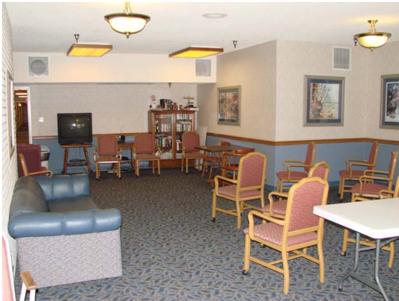
47-2007-05-02_064 P_E: Before - Living room.