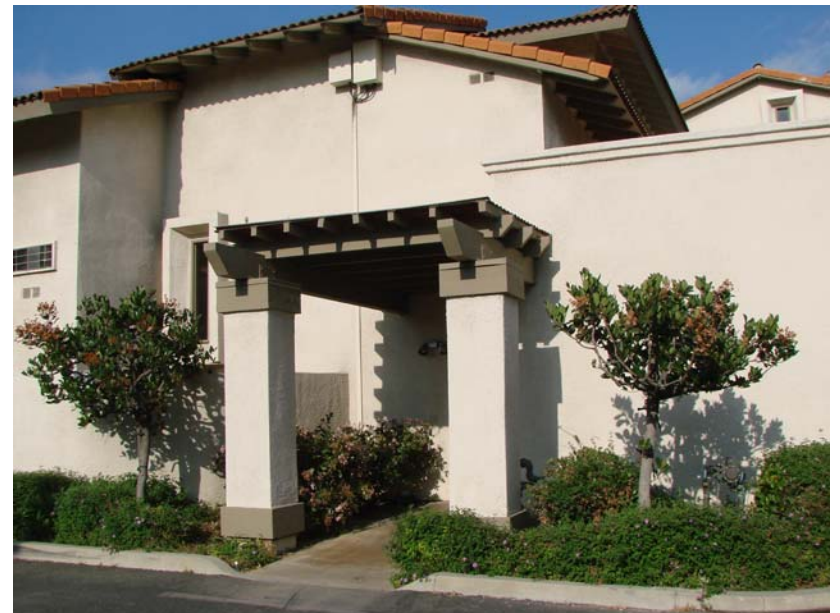
08-2009-04-23_DSC09438: After - repaired and re-painted wood.