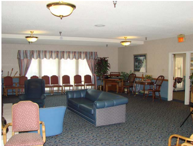
45-2007-05-02_059 P_E: Before - Living room.