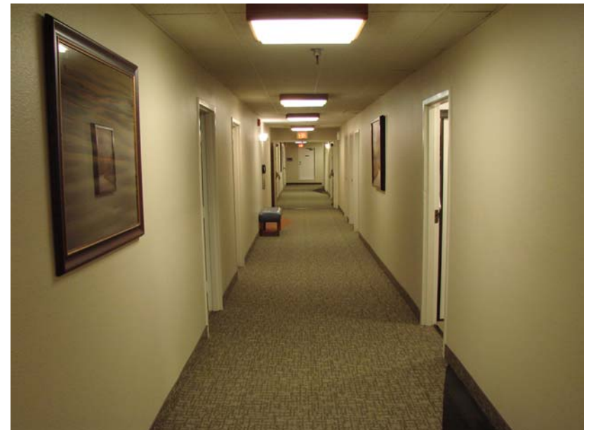
36-2009-07-31_DSC09384: After - Main entrance & corridors