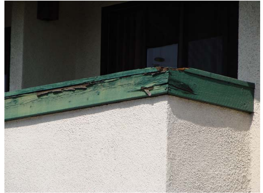
10-2007-05-02_034 P_E: Before - Detail - rotten wood trim on 2nd floor balconies.