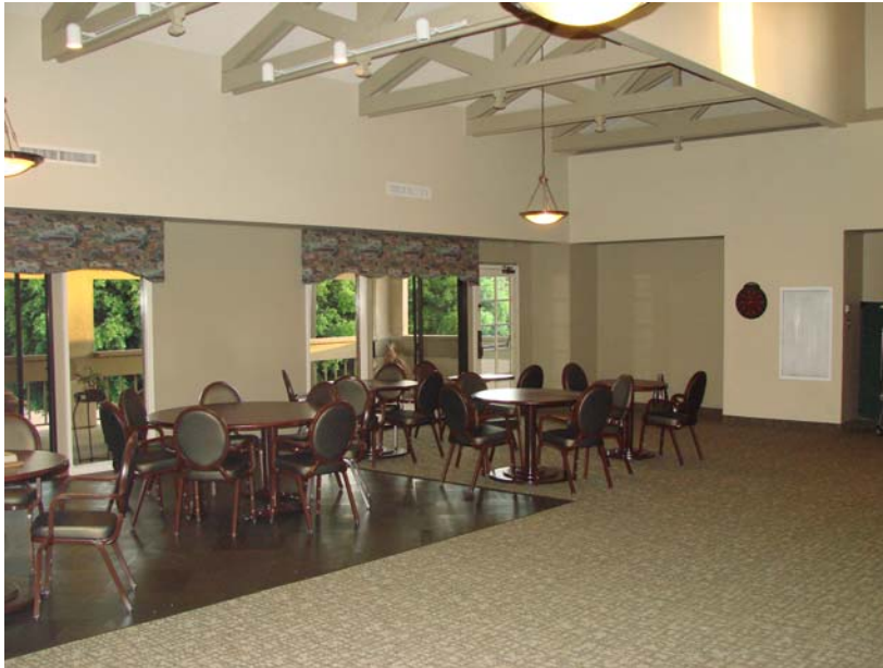
73-2009-07-31_DSC09345: After - 2nd floor game-recreation room.