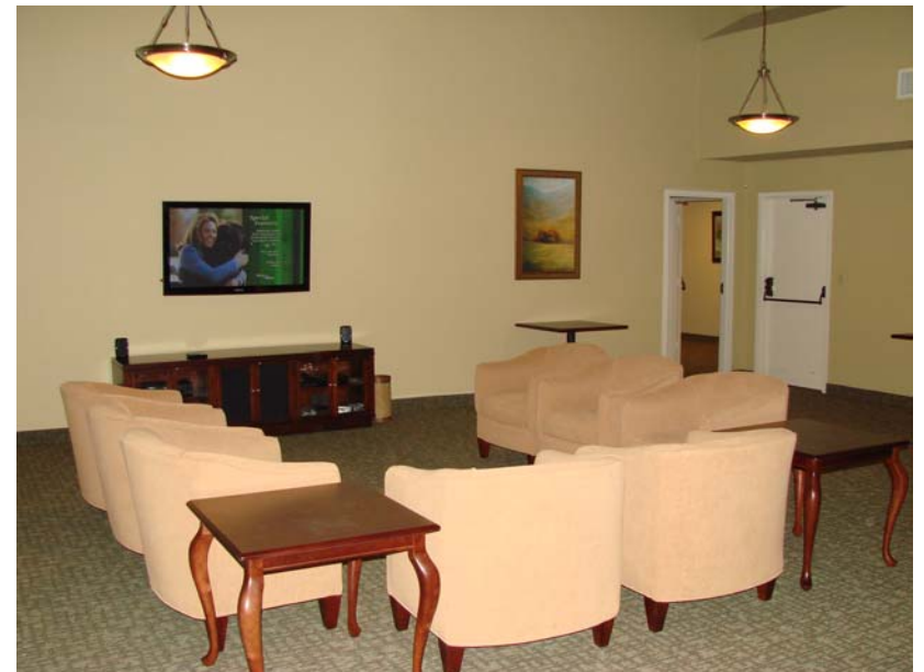
68-2009-07-31_DSC09497: After - 2nd floor Library & Movie Room