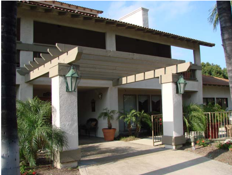
05-2009-04-23_DSC09433: After - repaired and re-painted wood.