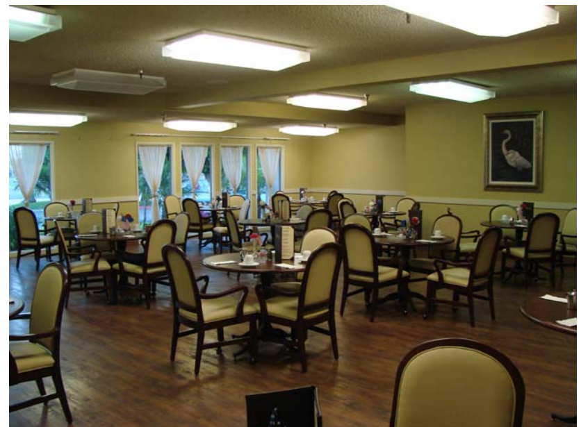
40-2009-07-31_DSC09306: After - Main dining room