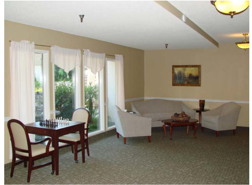
54-2009-07-31_DSC09237: After - 1st floor living room.