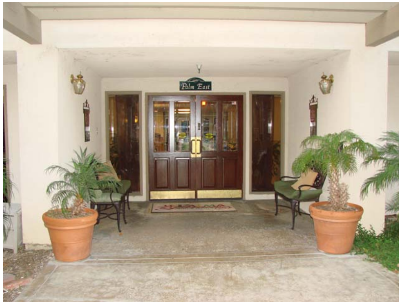
17-2009-07-31_DSC09399: After - Re-finished front entry doors.