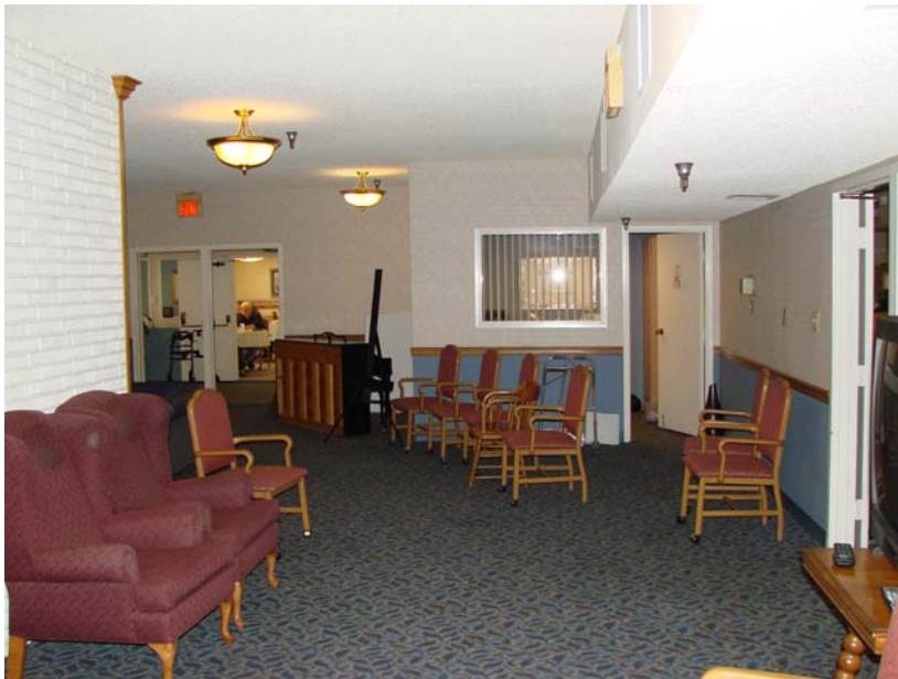
49-2007-05-02_058 P_E: Before - Living room.