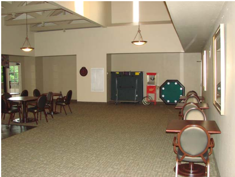
71-2009-07-31_DSC09343: After - 2nd floor game-recreation room.