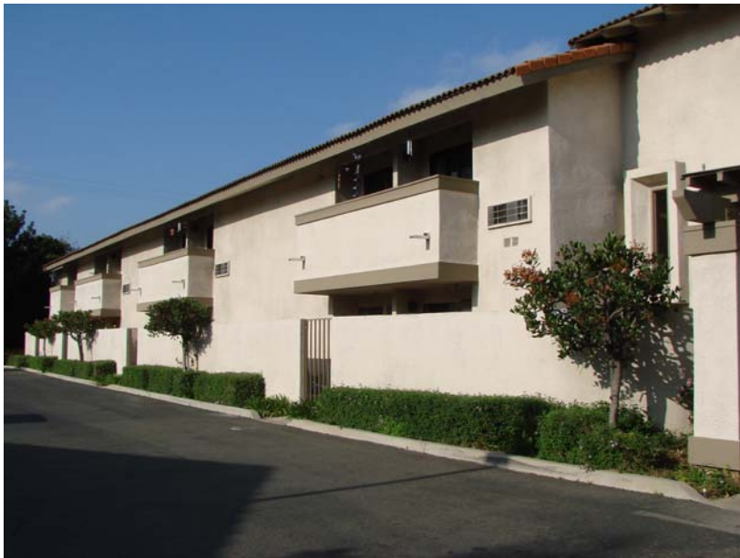
11-2009-04-23_DSC09437: After - repaired and re-painted wood.