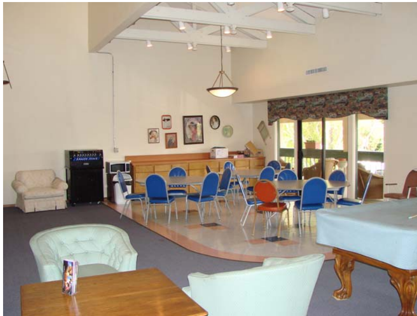
69-2007-05-02_109 P_E: Before - 2nd floor game-recreation room.