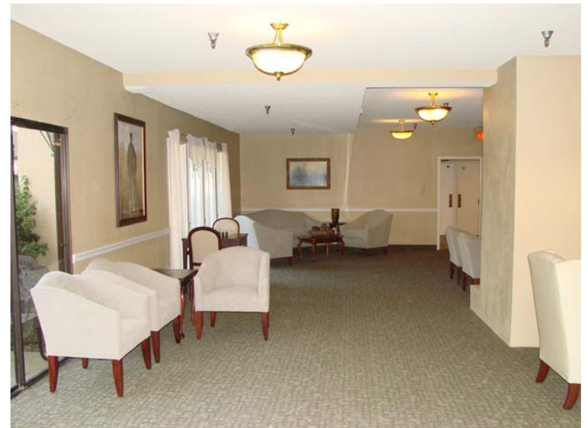
56-2009-07-31_DSC09223: After - 1st floor living room.