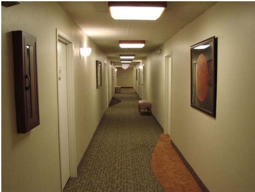
35-2009-07-31_DSC09376: After - Main entrance & corridors