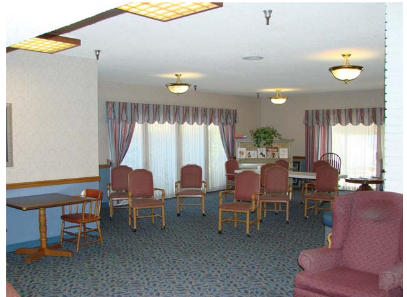
48-2007-05-02_057 P_E: Before - Living room.