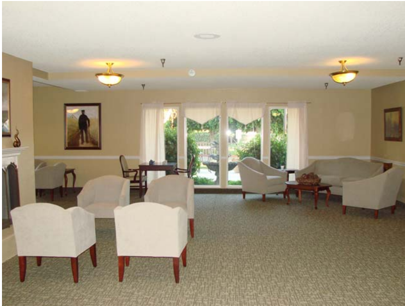
53-2009-07-31_DSC09253: After - 1st floor living room.