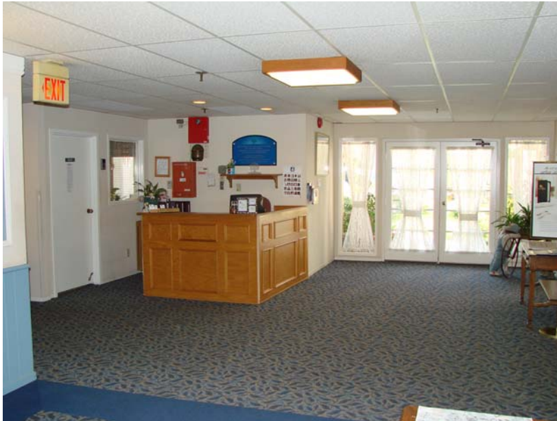
21-2007-05-02_055 P_E: Before - Reception desk at Palm East entrance.