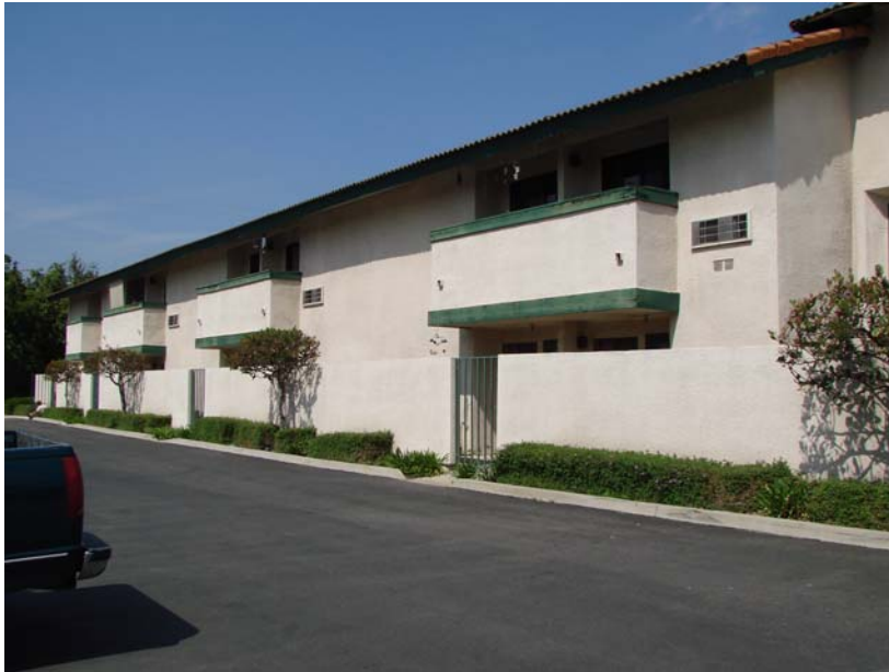
09-2007-05-02_033 P_E: Before - Palm East - west elevation. note rotten wood trim on 2nd floor balconies.