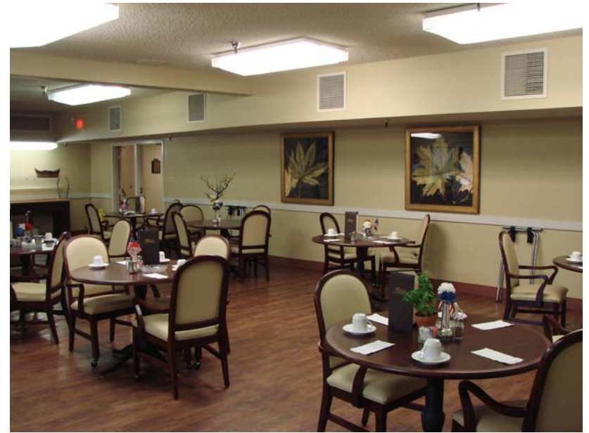
42-2009-07-31_DSC09298: After - Main dining room