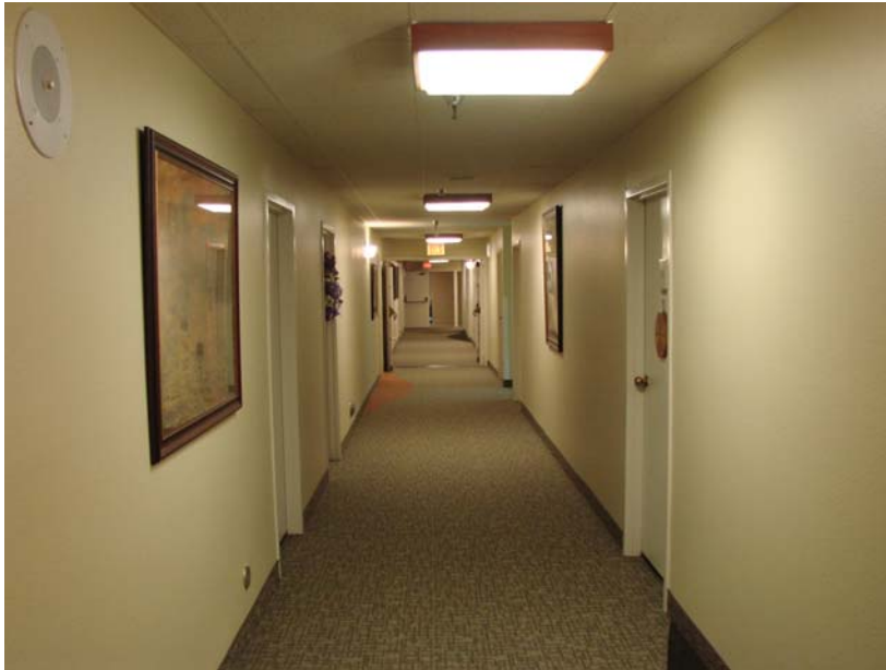
33-2009-07-31_DSC09327: After - Main entrance & corridors