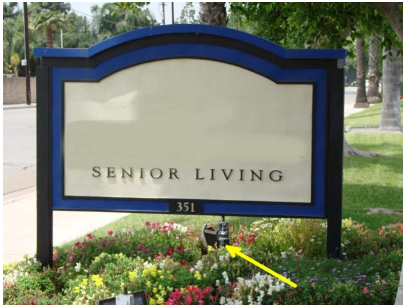
01-2007-05-02_002 P_E: Before - Facility identification sign. Note broken sign lighting.