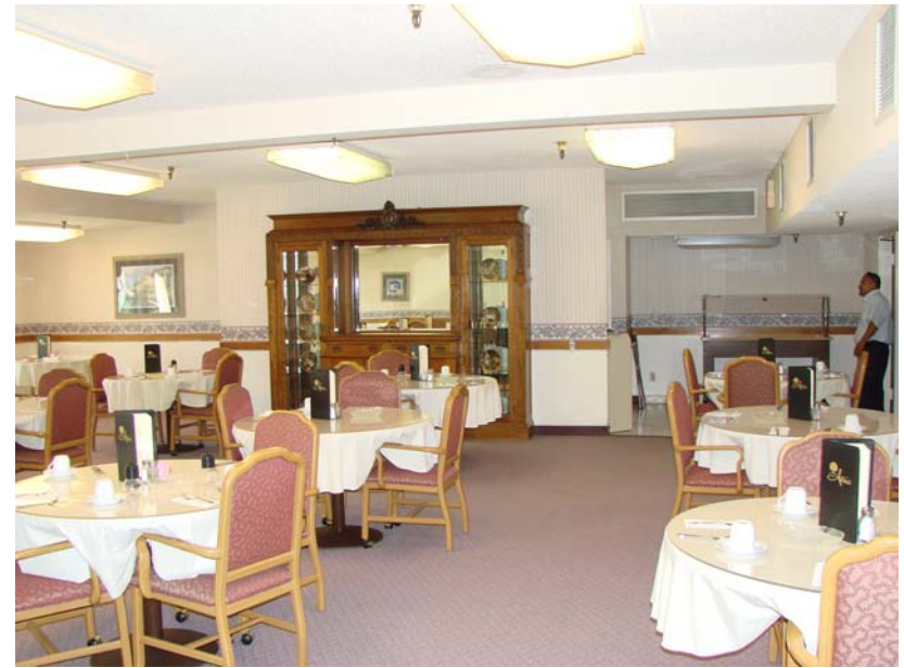
38-2007-05-02_068 P_E: Before - Main dining room - screen wall with kitchen access.