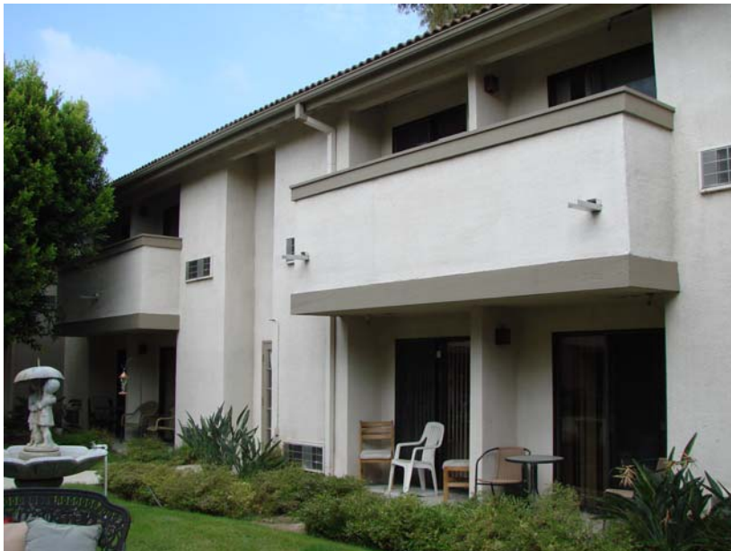
15-2009-04-23_DSC09359: After - repaired and re-painted wood.