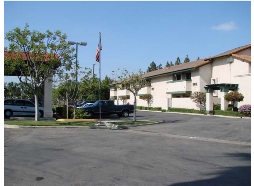
06-2007-05-02_013 P_E: Before - West elevation of Palm East (looking north).