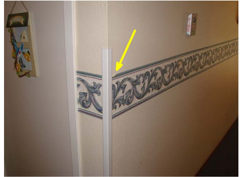
26-2007-05-02_087 P_E: Before - Detail - wallpaper border peeling at wall corner. (Note - staff has not yet begun 1st floor painting improvements.