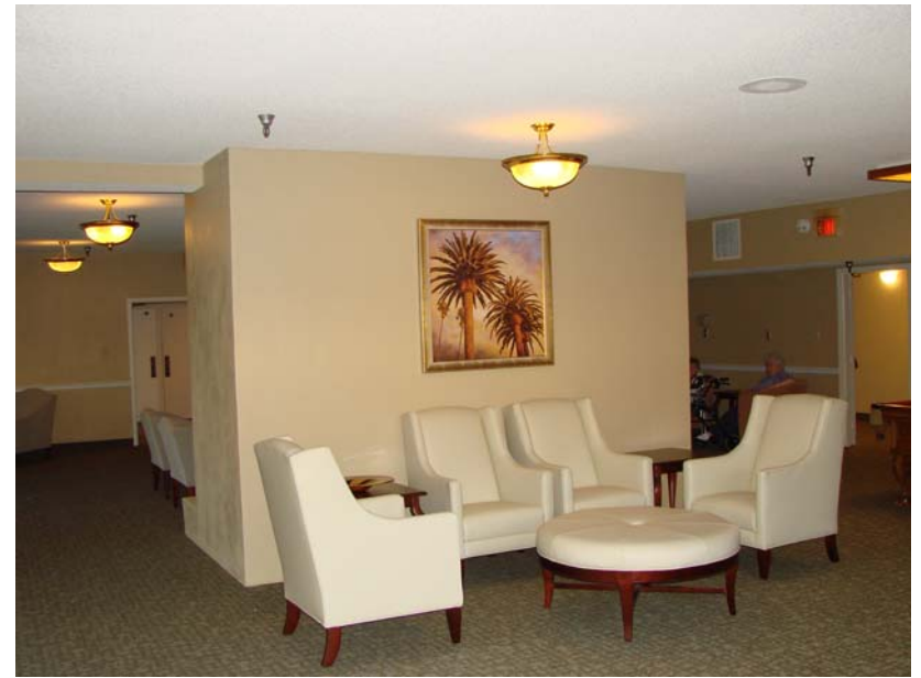
58-2009-07-31_DSC09224: After - 1st floor living room.