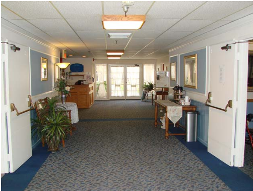
19-2007-05-02_054 P_E: Before - Front entry with reception desk and door into courtyard.