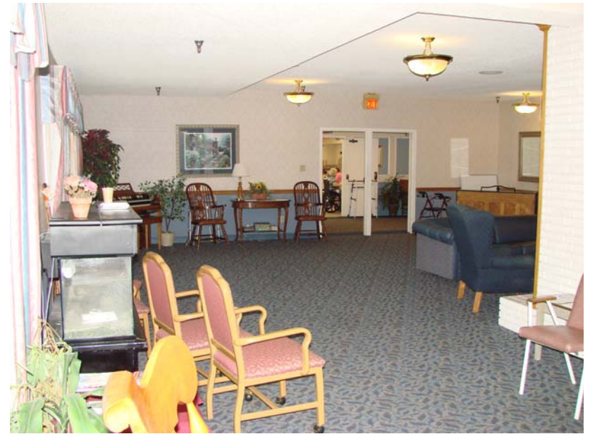
50-2007-05-02_065 P_E: Before - Living room.