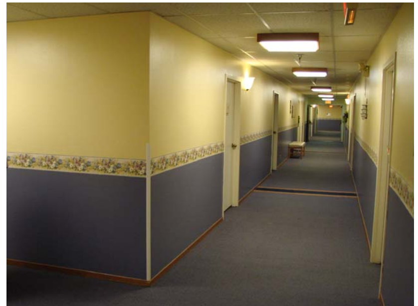
24-2007-05-02_119 P_E: Before - 2nd floor West Hall looking south.