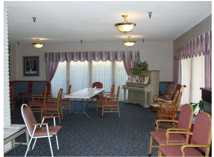
46-2007-05-02_063 P_E: Before - Living room.