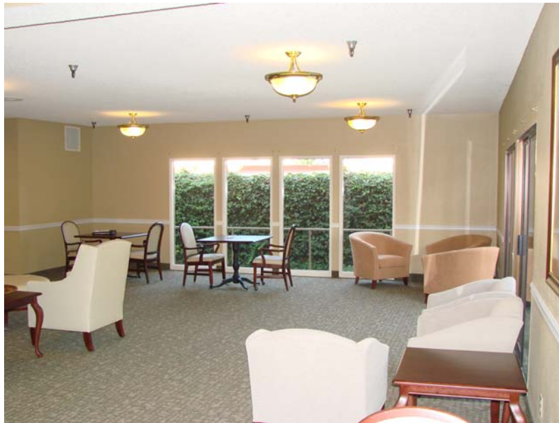
57-2009-07-31_DSC09241: After - 1st floor living room.