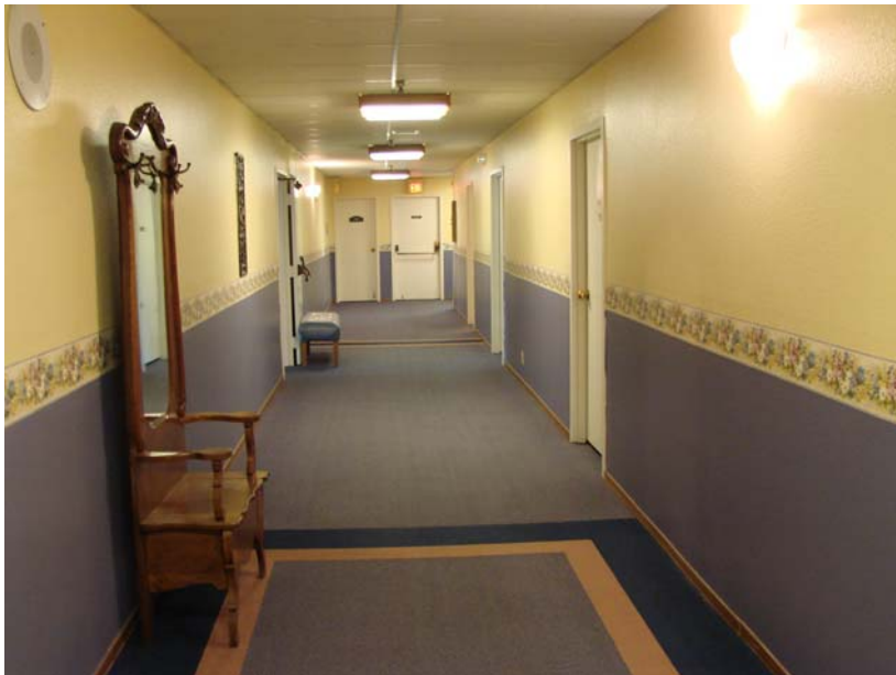
23-2008-05-19_DSC08586: Before - Palm East - typical 2nd floor corridor. Wood base, painted walls, no handrails, wallpaper border transition. Paint and