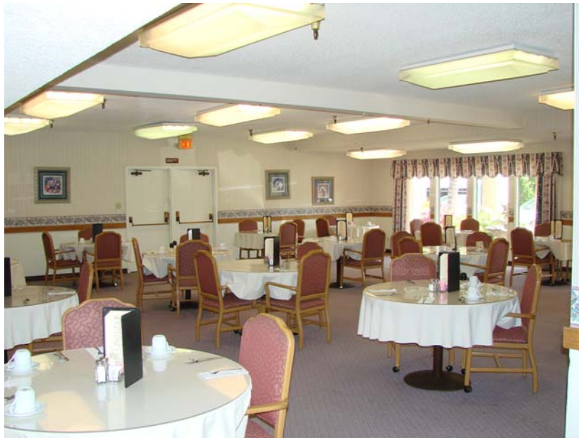
37-2007-05-02_066 P_E: Before - Main dining room.