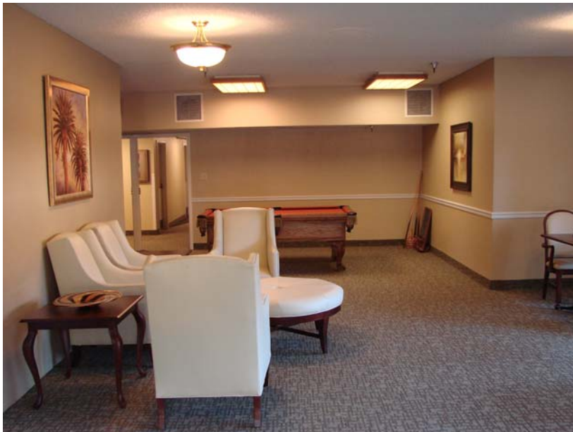
59-2009-07-31_DSC09229: After - 1st floor living room.