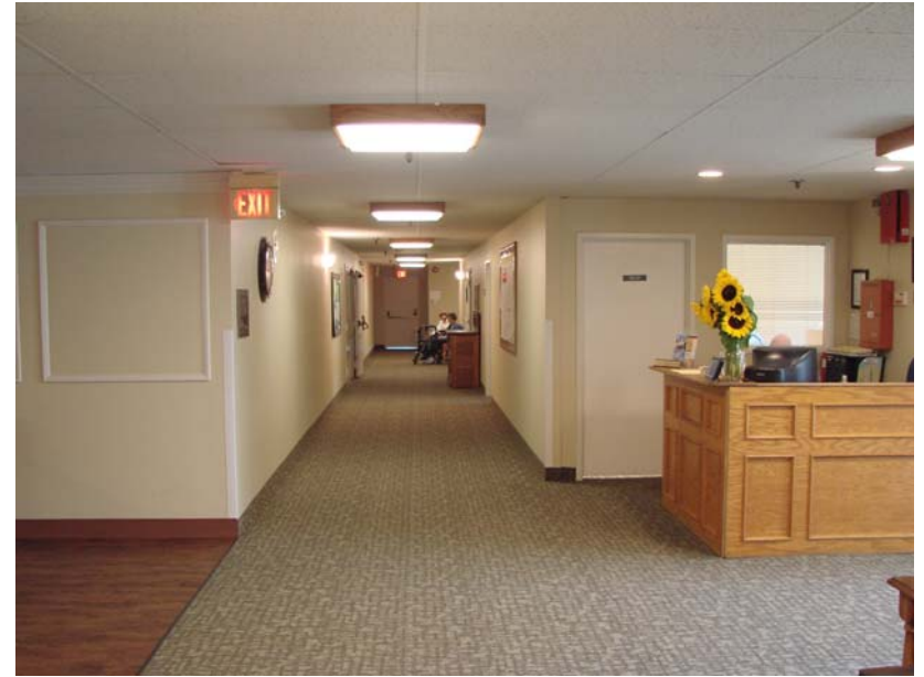
30-2009-04-23_DSC09302: After - Main entrance & corridors