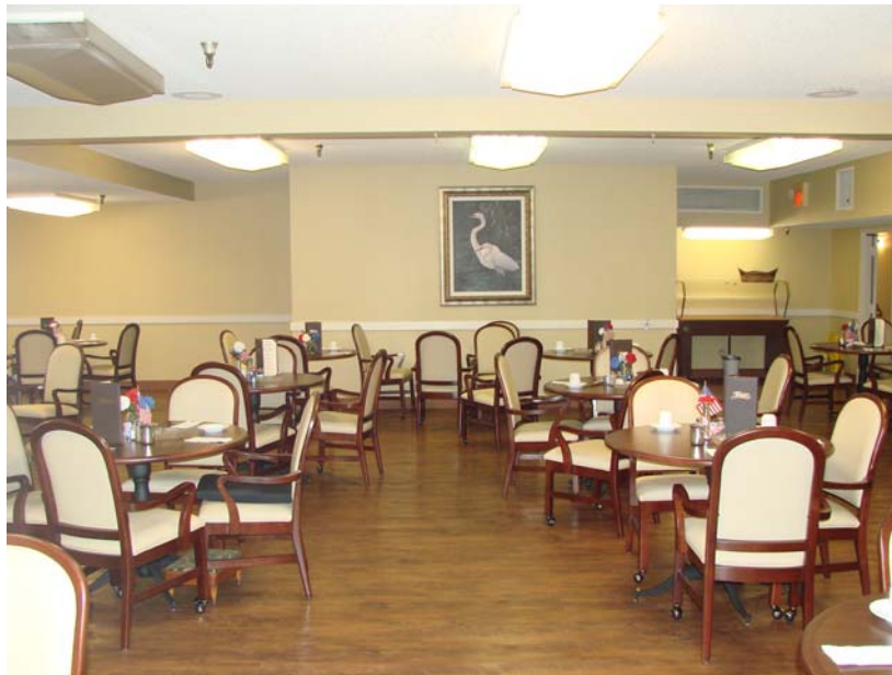
41-2009-07-31_DSC09295: After - Main dining room