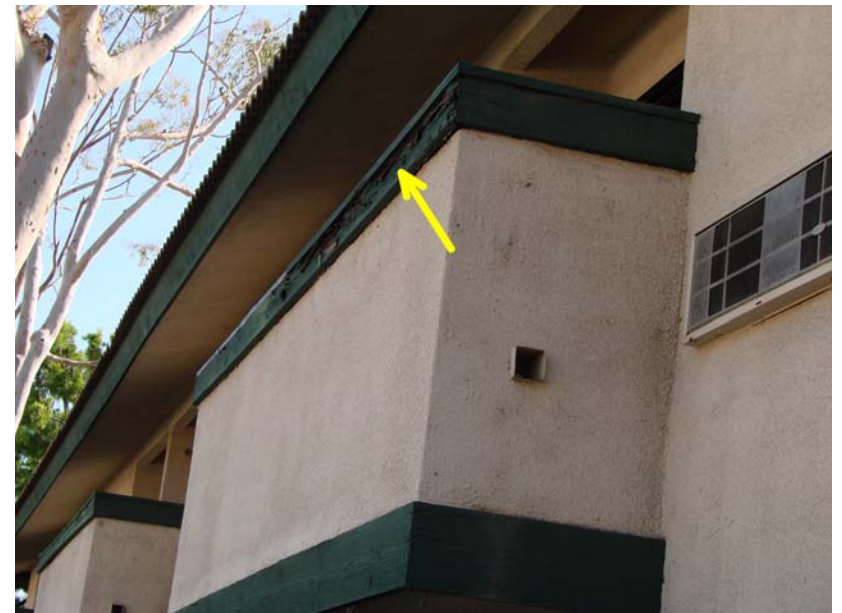
12-2007-05-02_042 P_E: Before - Detail - rotten trim on 2nd floor balcony.